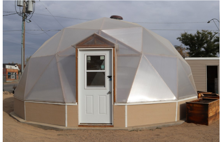
The Greenhouse at the Co-op Community Food Farm

Please contact Taylor at the Watershed if you are interested.